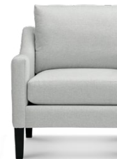
Saturday Up-Slope Arm