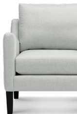
Sunday Down-Slope Arm