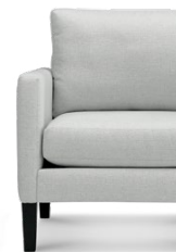
Tuesday Track Arm