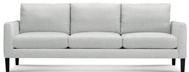
3 Back + 3 Seat Cushions