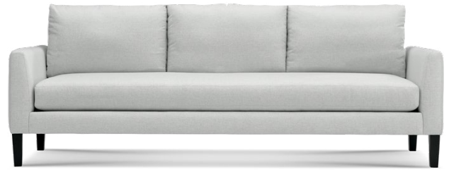
3 Back + 1 Bench Cushion