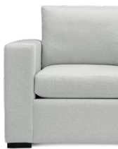
Wednesday Grande Wide Track Arm