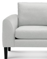
Monday Modern Arm