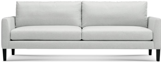
2 Back + 2 Seat Cushions