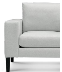
Wednesday Wide Track Arm