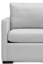
Tuesday Grande Track Arm