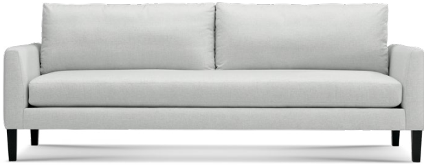
2 Back + 1 Bench Cushion