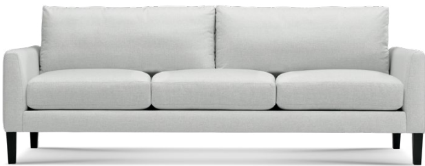
2 Back + 3 Seat Cushions